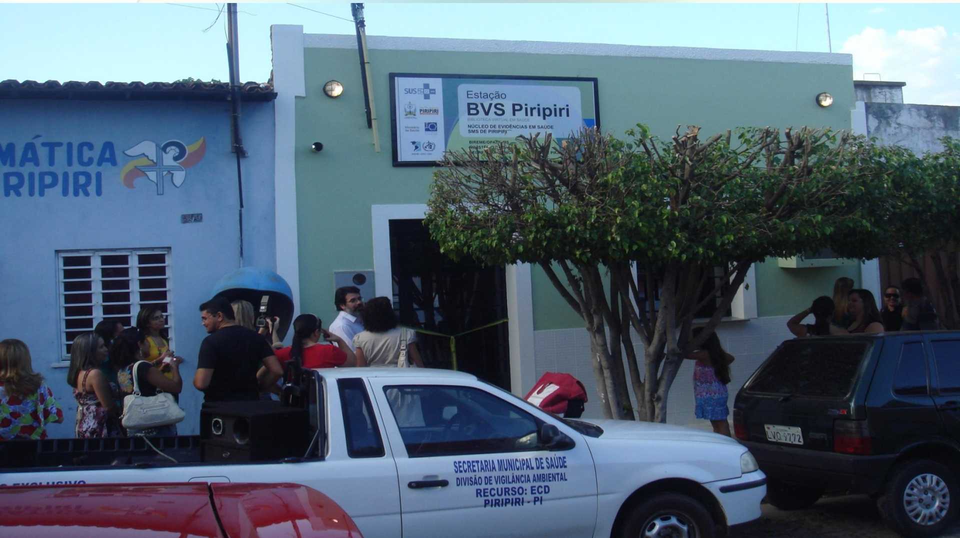
Launch of Piripiri Evidence Centre/Virtual Health Library, Piripiri, March 2010